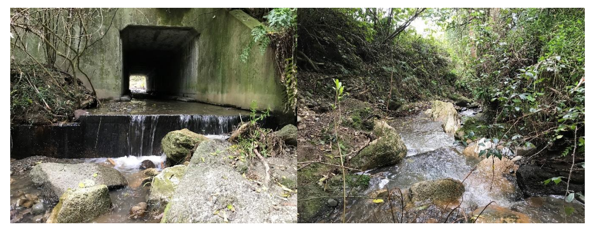
Figure 1: Culvert that runs under the Kiwirail rail line were catchment seven enters the Manawatū River. Photo on the left shows the raised culvert outlet creating a barrier to fish passage for the majority of native fish, Photo on the right is downstream of the culvert looking towards the Manawatū River.